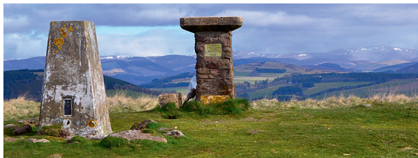
View from Alyth Hill with Trig Point and Brass Plaque

FREE: pre-booking essential via www.commonculture.org.uk TAKE PART section