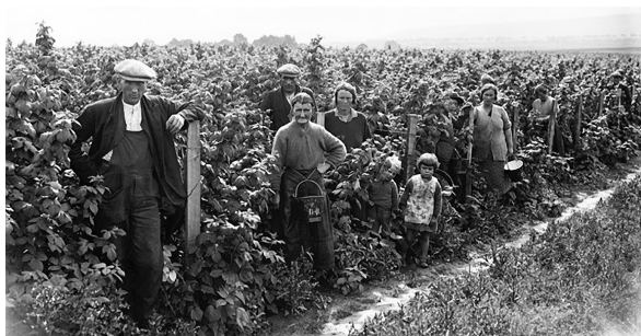
Strathmore Berry Pickers in 1933

FREE: pre-booking essential via www.commonculture.org.uk TAKE PART section