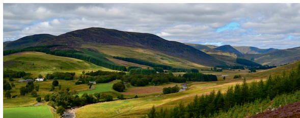
Glenshee from the Cateran Trail