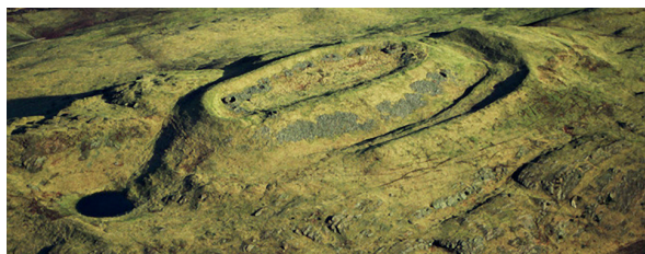
Barry Hill Fort, Alyth

website for details: www.barryhillfort.eventbrite.co.uk